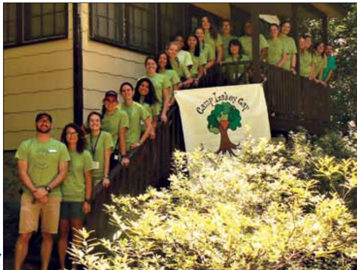
2017 Camp Lakey Gap Staff